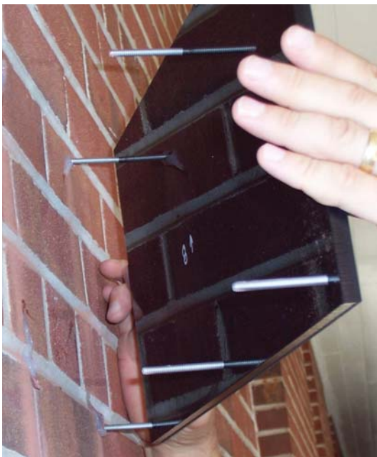
We filled the holes with silicone and installed the sign.